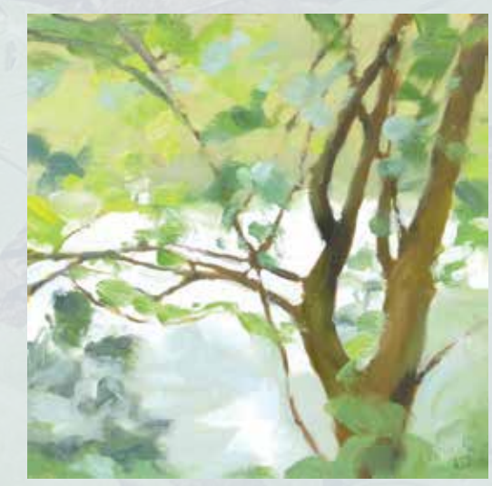
Julia Sutliff, "Tree by Pond, Quiet Light," oil on board, 11" x 11"