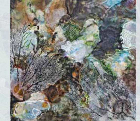
Marilyn Banner, "Approach," encaustic on wood, 14" x 14"

Plein air painter Julia Sutliff searches out natural landscapes wherever she can find them near her home north of Baltimore. Even in the sprawl of the city's suburbs, she discovers woods, ponds, streams, and fields and paints them onsite with fresh, energetic brushstrokes. In Four Seasons, on view August 2 through September 30, Sutliff presents paintings that celebrate the natural landscape throughout its seasonal cycles. Reception: Saturday, August 13, 3–5 p.m.