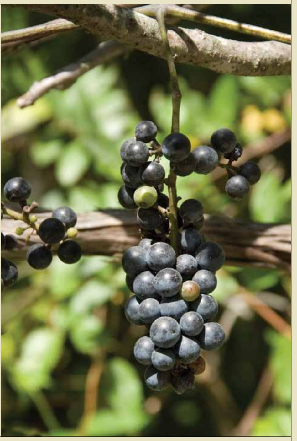
fox grape Vitis labrusca

12610 Eveland Road P.O. Box 100 Ridgely, MD 21660 410-634-2847 www.adkinsarboretum.org