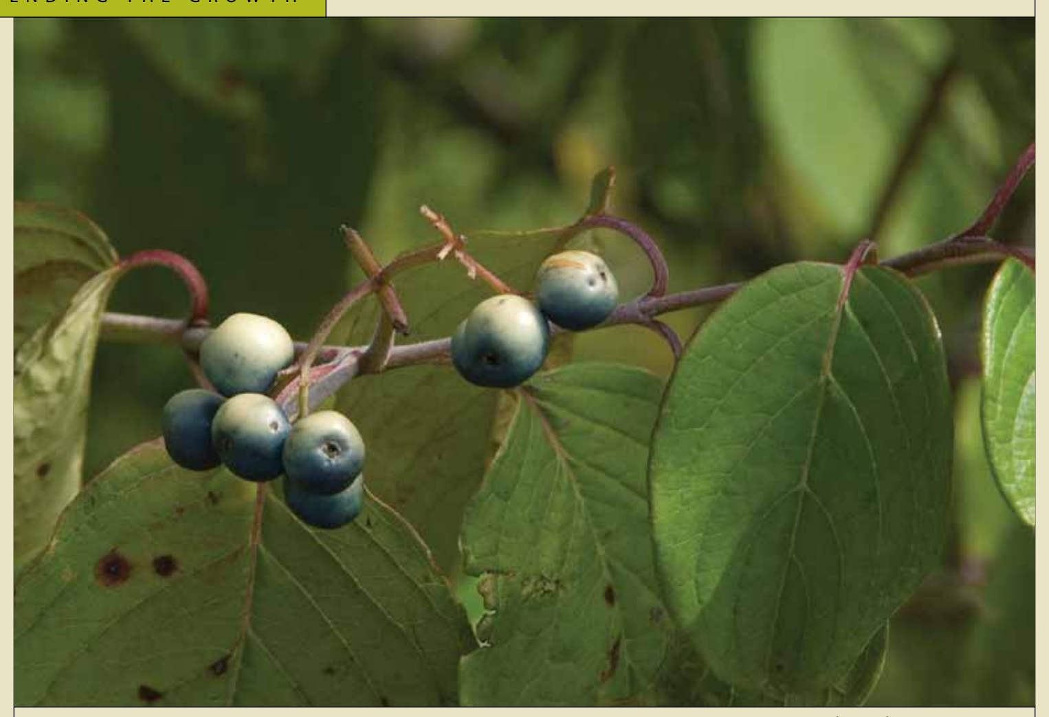
gray dogwood Cornus racemosa