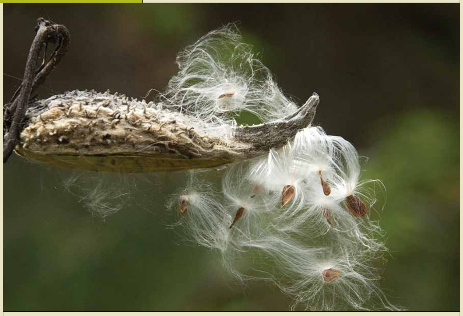
common milkweed Asclepias syriaca