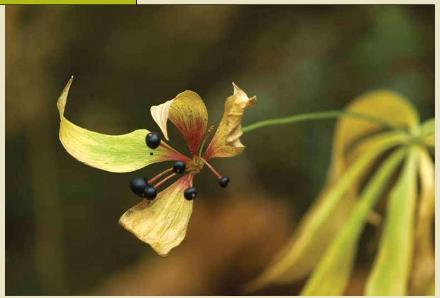
Indian cucumber Medeola virginiana