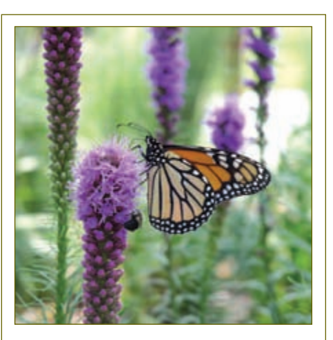
Danaus plexippus, (dan-OWS PLEX-i-pus) Monarch Butterfly—Wingspan: 3 ½ - 4 inches. The colors of the Monarch caterpillar and butterfly are a warning, "I taste bad." This bad taste comes from chemicals in the milkweed plants the caterpillars eat. Goldenrods are a favorite nectar source of fall migrating Monarchs. They will also get nectar from common garden plants such as aster, zinnias, and Joe Pye.