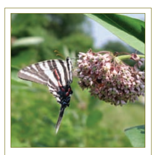
Eurytides marcellus, (yur-RI-tuh-dees mar-SEL-us) Zebra Swallowtail— Wingspan: 2 ½ -3 ½ inches. The pawpaw (Asimina triloba), is the only food plant for the caterpillar of this usually large black and white striped butterfly with two red dots, two blue dots, and very long tails. It flies to nearby fields and gardens searching for dandelions, milkweed, redbud and garden flowers.