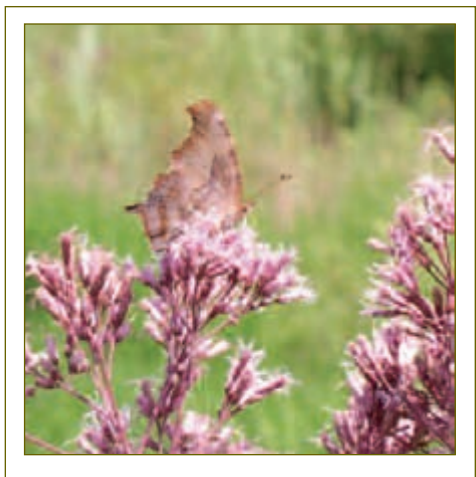
Polygonia interrogationis, (po-lih-GO-nee-ah in-ter-ro-gat-ee-OHN-is) Question Mark—Wingspan: 2 ½ inches. Named for the silver question mark on the underside of its hind wing, you may mistake this butterfly's scalloped wings and coloring for a dead leaf. Adult butterflies visit meadow flowers only if their favorite foods (aphid honeydew, tree sap, animal dung, and rotting fruit) are unavailable.