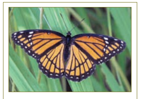
Basilarchia archippus, (ba-sil-ARC-ee-ah ARC-i-pus) Viceroy—Wingspan: 3 inches. A mimic of the Monarch, you can tell a Viceroy butterfly by the black line that crosses the lower wings. Viceroys live in or near wet areas and would rather eat rotting fruit and animal dung than flowers, although you may see them at asters or goldenrods.