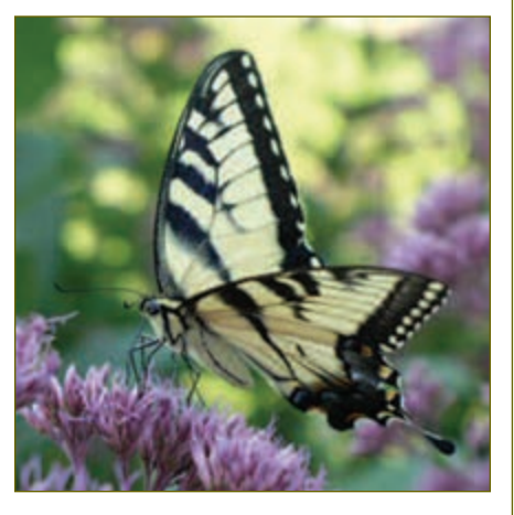
Papilio glaucus , (pa-PIL-ee-oh GLAW-kus) Eastern Tiger Swallowtail— Wingspan: 3 1/8 - 5 inches. The tiger pattern of the yellow with black stripes is always seen in the male butterflies. The yellow form of the female has an area of blue on the hind wings. Although these butterflies live in or near the woods, they are strong fliers and will often visit meadows and gardens looking for flowers.