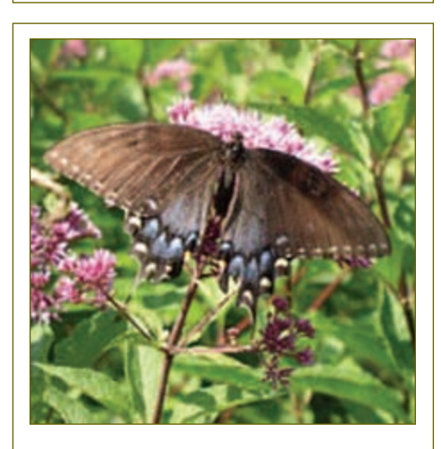
Papilio glaucus, Dark Tiger Swallowtail— The second form of the female tiger swallowtail is a dark brown or black with a blue area on the hind wings. These butterflies head for beebalm, honeysuckle, butterfly bush, sunflowers, and other garden flowers when they are looking for nectar.